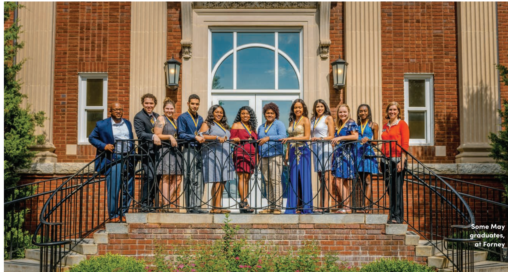
Some May graduates, at Forney

As you can see, we have stuck some pretty significant “stakes in the ground” (another metaphor!) to mark our progress and show how we are taking “Giant Steps.”