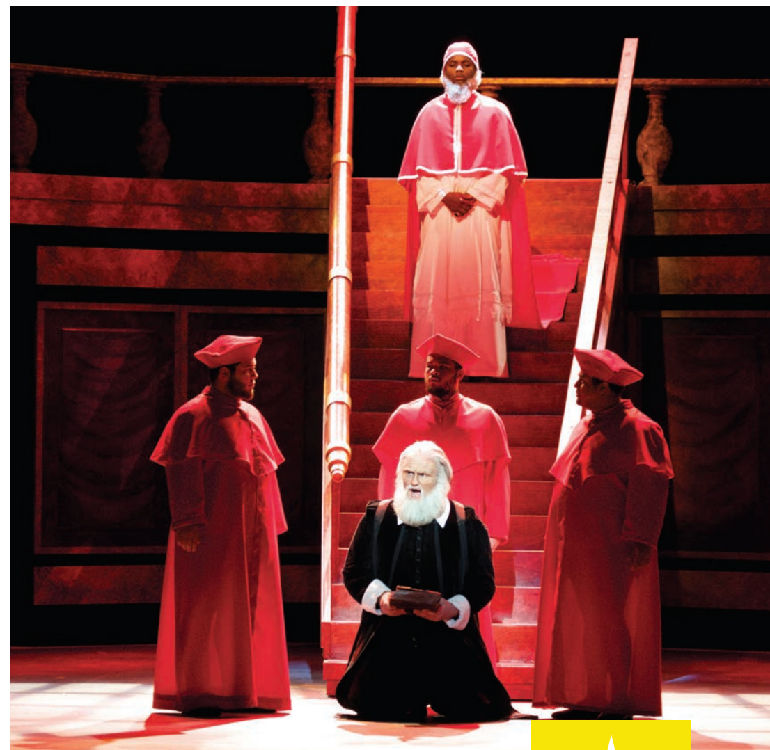
PHOTO OF GALILEO GALILEI, PHOTO OF FREEDOM RIDERS: THE CIVIL RIGHTS MUSICAL ; PHOTO OF 'IN THE HEIGHTS'

“It's a different kind of hard work. It's a different pace. We're always asked by those around us, by friends, ‘What's next?’ We rarely get a chance to live in what we just achieved. So that's the first thing I did. Once I found a pace and felt comfortable with it, then it was time to create other opportunities. I still have my entire career ahead of me, and I know there are other things I want to do. But the lessons we learn in the experience are what prepare us for our next steps in life.”