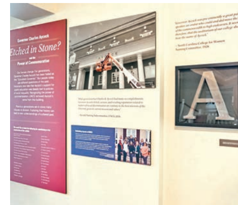
Here, the brass "A" that appeared on the auditorium for many years. Above, the letters when they were removed.

The exhibition can be viewed during public events and is located on the second floor of the auditorium.